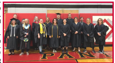
The TCN HS staff dressed in graduation regalia on Halloween to kick-off College Awareness Week. All teachers took a time-out to tell their college journeys.

From the Tri-County North High School staff, we would like to wish all of our PANTHERS a happy and healthy 2019. #WeGotThis